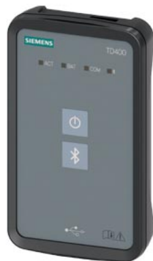
TD400 Kit commissioning and service tool IEC 3WL (Release 2) and 3VA TD400 Kit with Adapter, cable, and suitcases