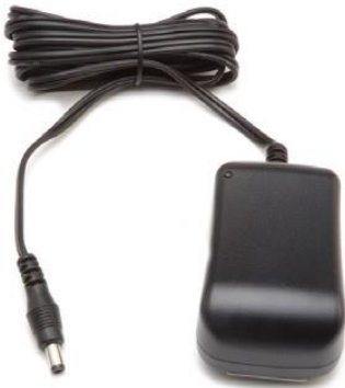
Power converter (24VDC to AC)