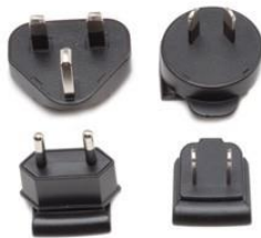
Power pin adapters