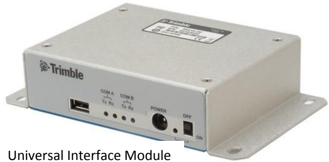
Universal Interface Module (RS-422 to USB converter)