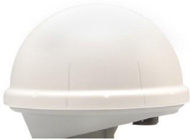
Acutime™360 Multi-GNSS Smart Antenna