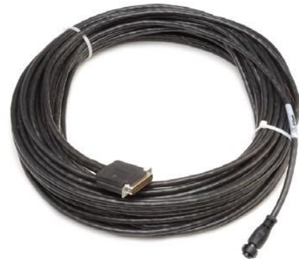
100 feet of interface cable with DB-25 connector