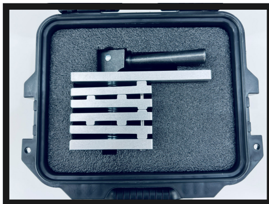
I-Line Cam Clamp Kit

Single cam lever operation to quickly connect a high current test set to the venerable I-Line panel bus for testing breakers in situ. This is typically used during maintenance testing where speed is important. One I-Line Cam Clamp stab is included in a custom fitted Storm case