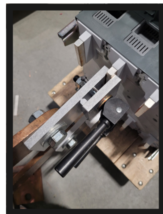
Cam Clamp in use